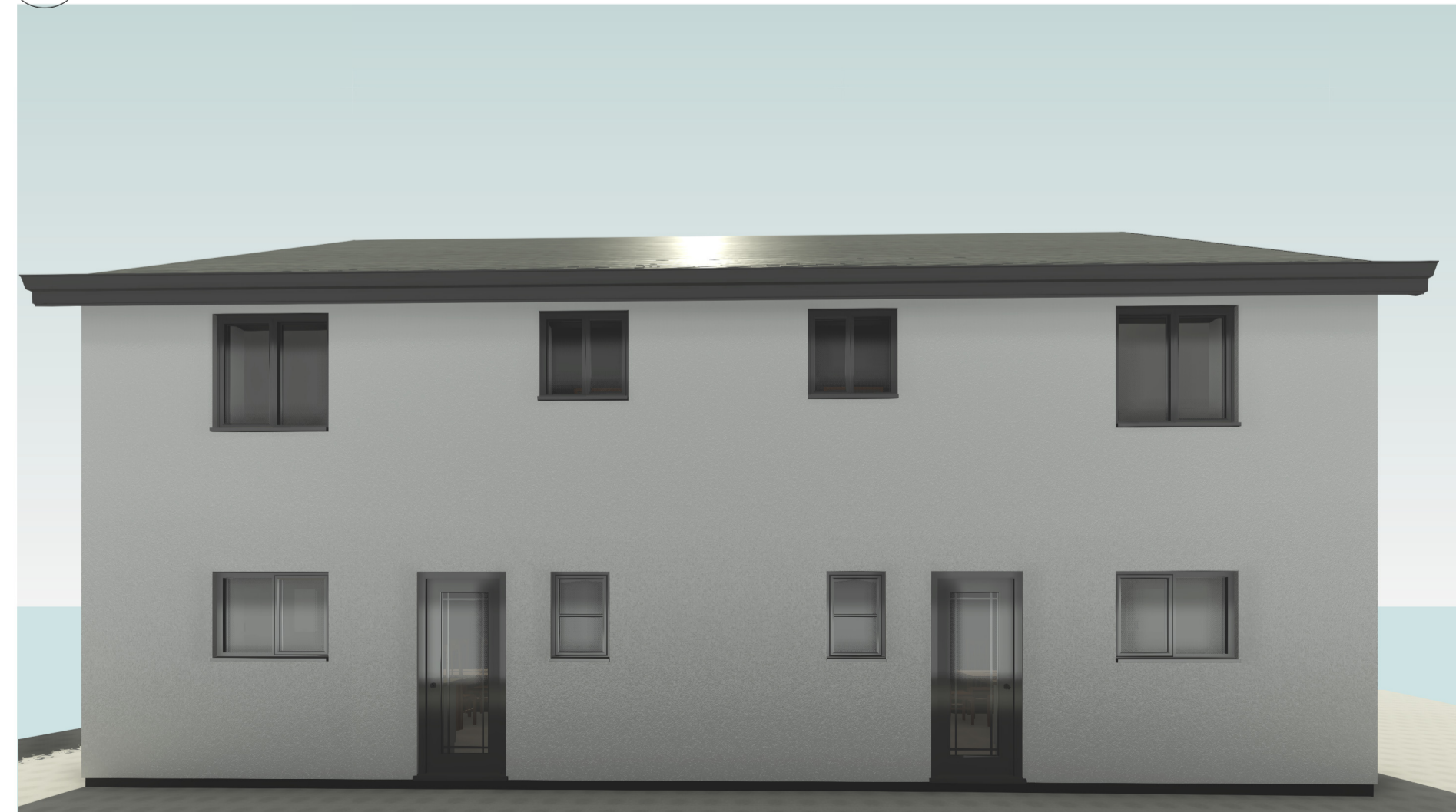
4 3D View 3