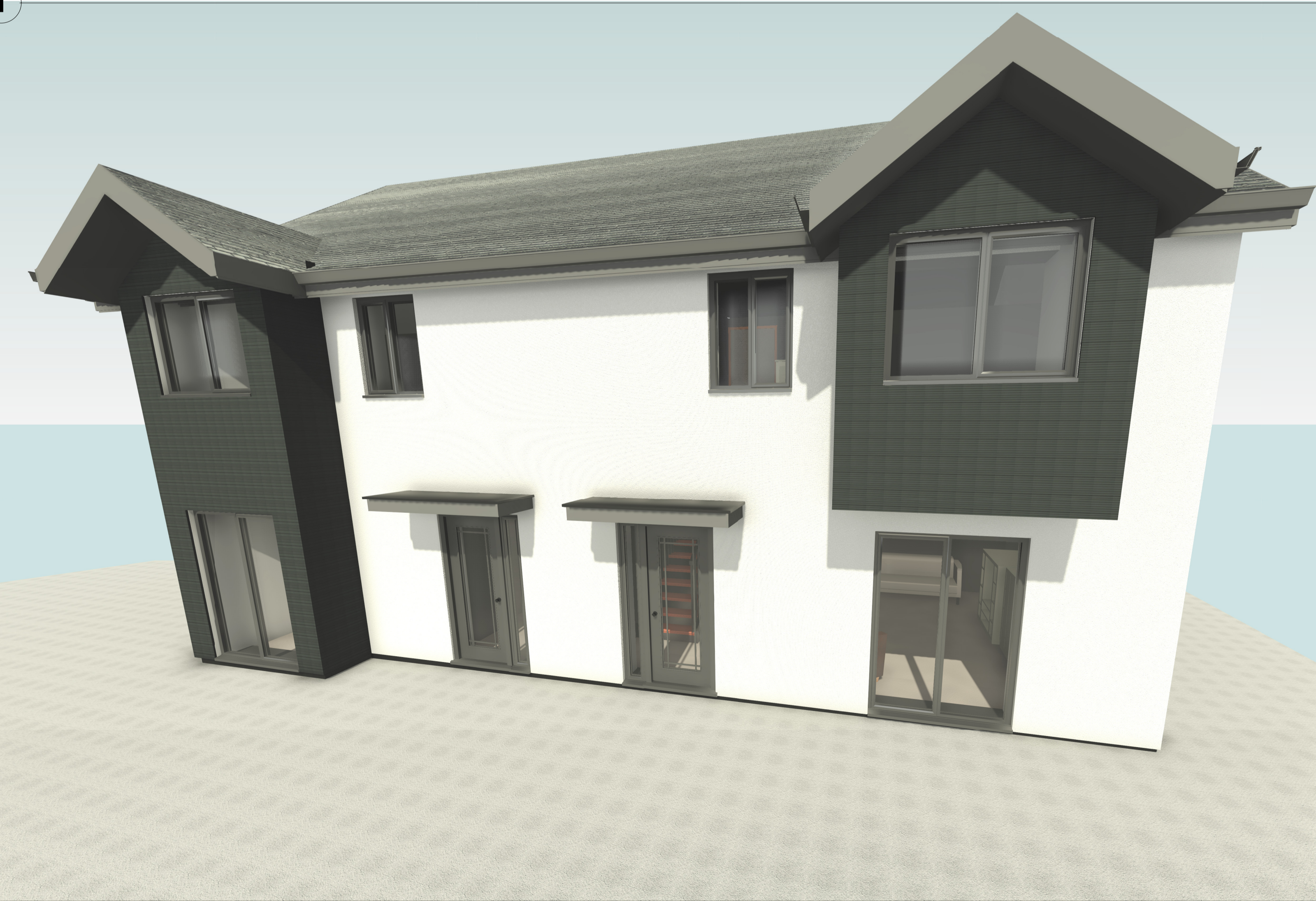
5 3D View 4