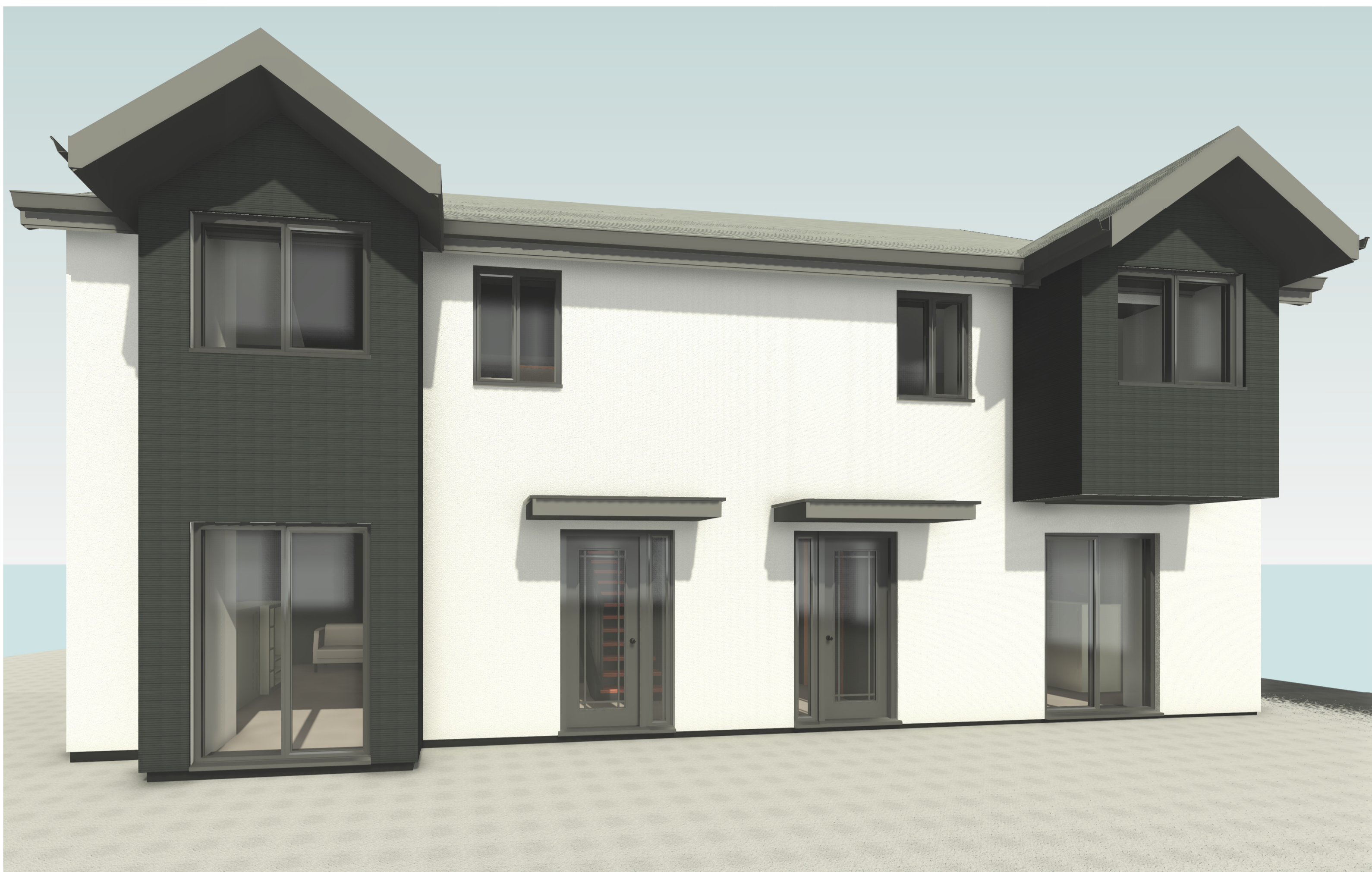
1 3D View 1