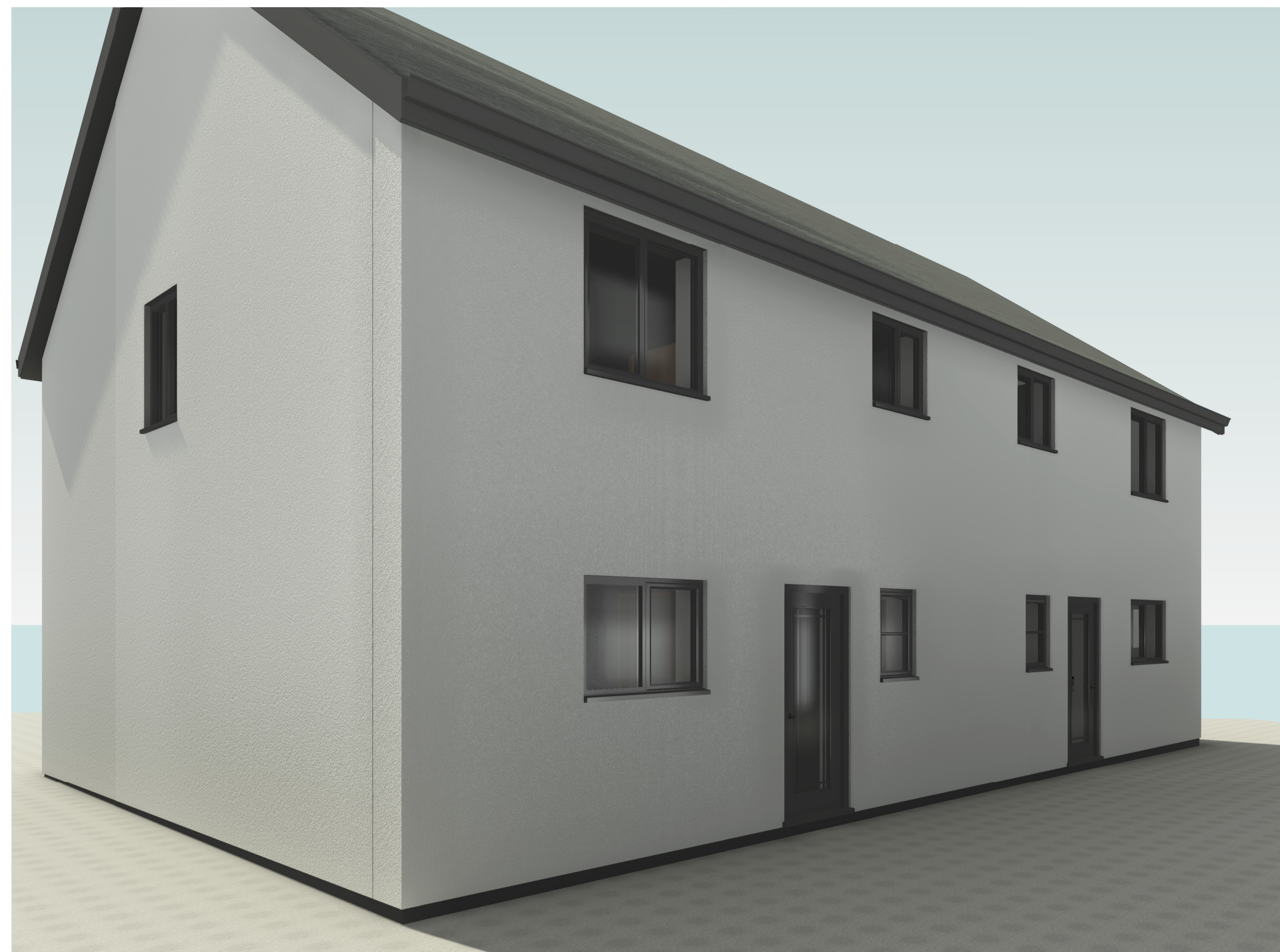
2 3D View 2